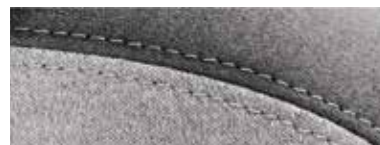
SOUL EV GRAY CLOTH W/GRAY STITCHING (Shadow Black exterior only)