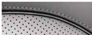
SOUL EV + ( plus ) GRAY LEATHER W/BLACK PIPING (Shadow Black/Inferno Red & Shadow Black exteriors only)