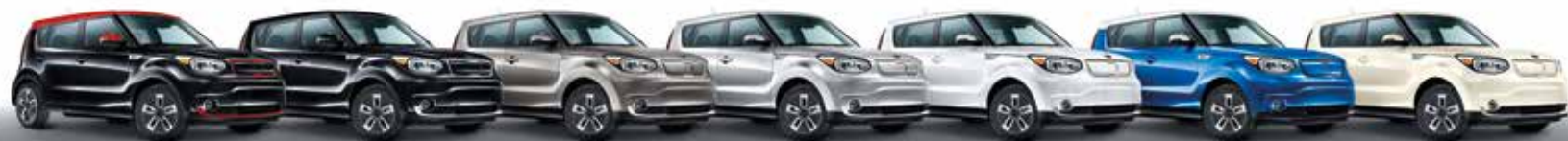
SHADOW BLACK W/INFERNO RED ROOF (EV + plus ) only